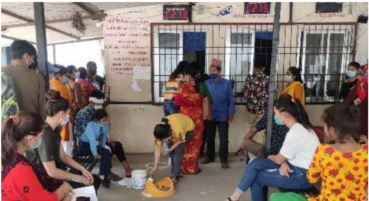
Provision of Social distancing at MBAHS, Hetauda Hospital by Department of Public Health