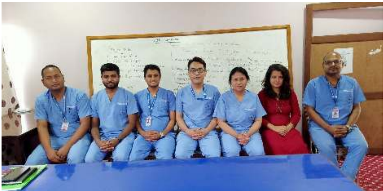
Problem Based Learning session for the faculties of MBAHS