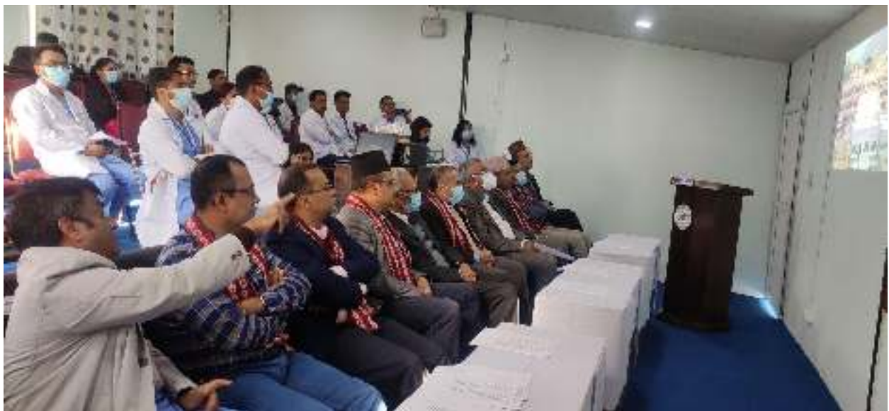
MEC personnels observing the introductory video of MBAHS while welcoming them.