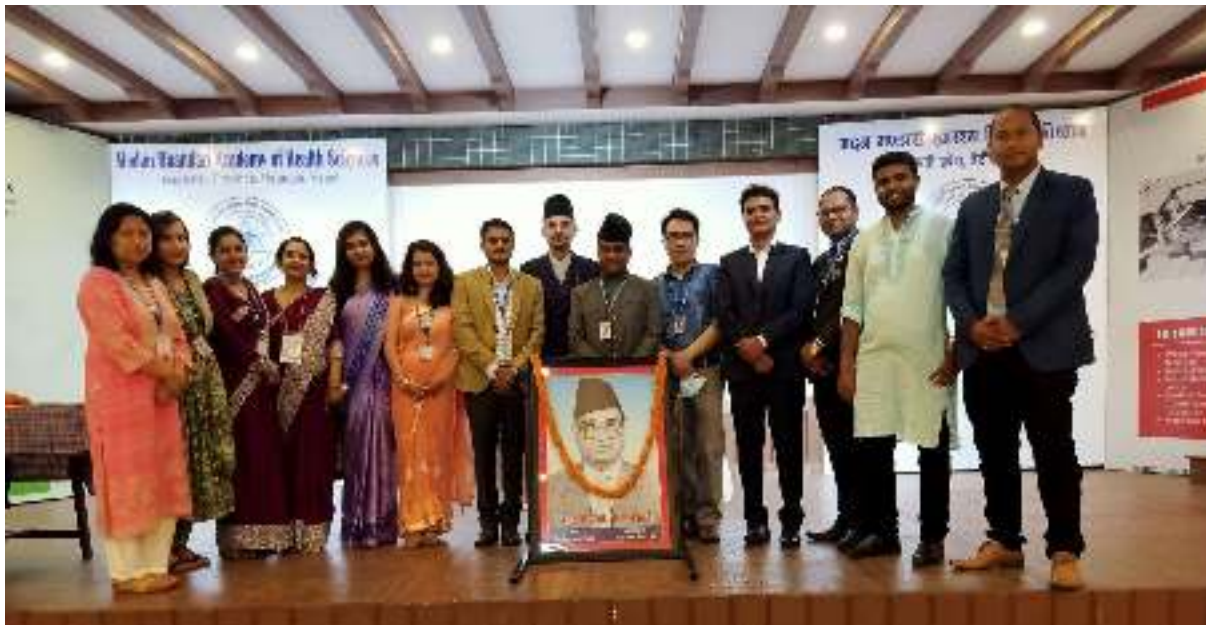
Inauguration Day Celebration - 2078-03-14