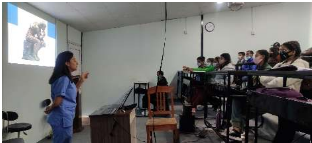
Workshop on Critical thinking