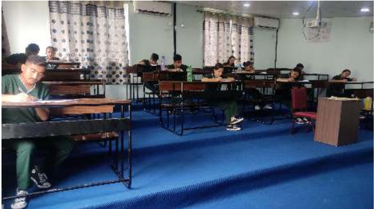
Students Appearing in the formative exam of MBAHS