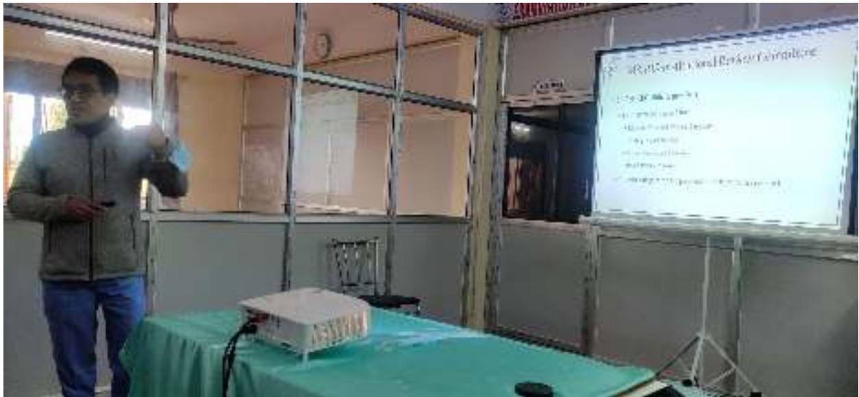
Presentation about MBAHS,IRC to ERB members of NHRC