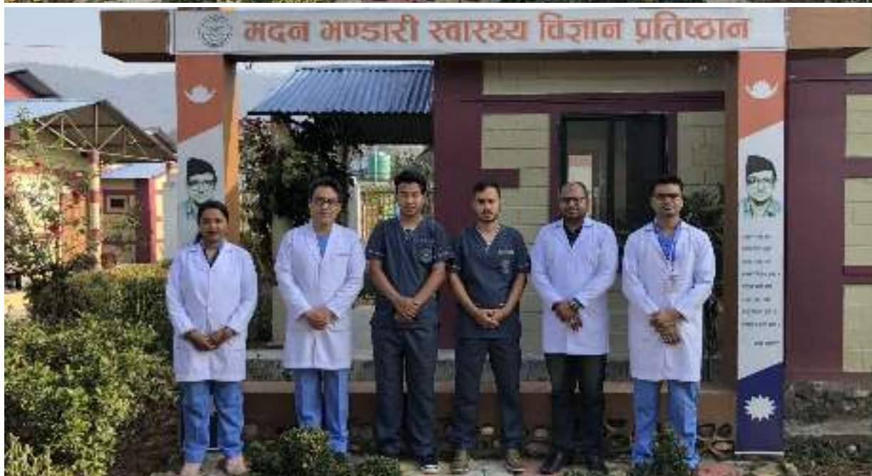
First batch students of BPH and BSc.MLT with their respective faculties