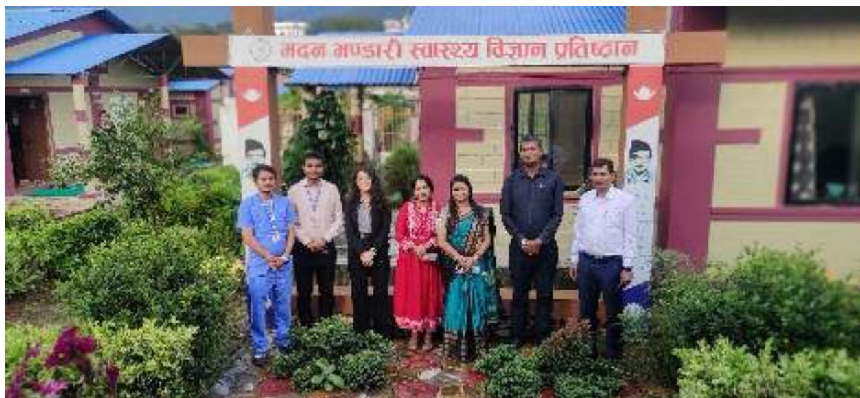
Hon'ble Vice-Speaker of Madhesh Province Upma Deo visits MBAHS