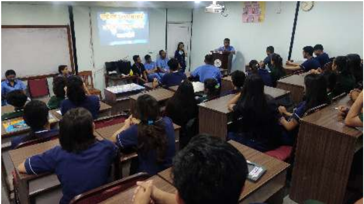
Exchange of best wishes during new year 2079 B.S.