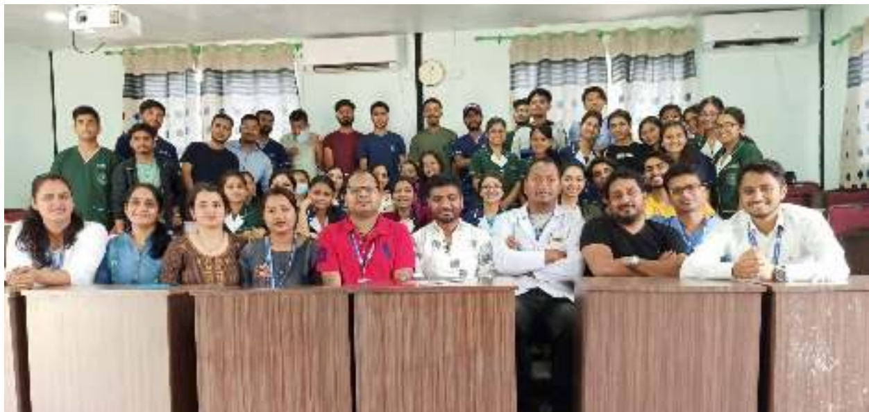
Faculties, staffs and students After Poem recitation in Poetry club, MBAHS