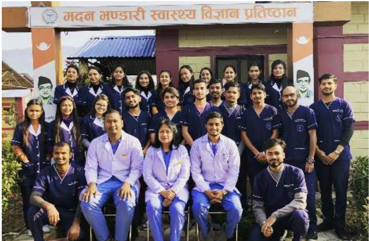
First batch students of B. Pharmacy with their respective faculties